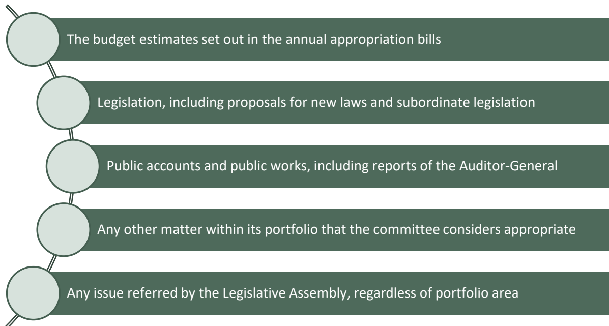
Figure 1: Committees are responsible for oversight of many matters within their portfolio areas

The committee has a broad range of responsibilities within its portfolio area, as detailed in Figure 1, below. These responsibilities are set out in the Parliament of Queensland Act 2001 . 7