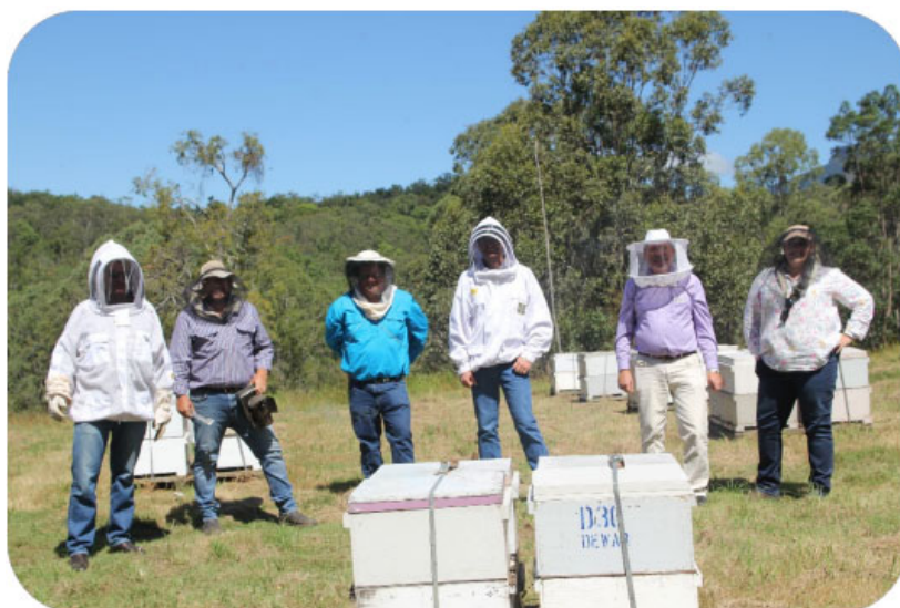
Source: Sub-committee apiary site visit, Scenic Rim, 1 April 2022

The Bill was still before the Parliament by the end of the reporting period.