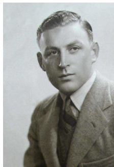
Image courtesy of the National Archives of Australia. NAA: A9300, CHINCHEN G T