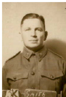
NAA B883, QX24902