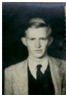
Image courtesy of the National Archives of Australia. NAA A9300, WARNER J H