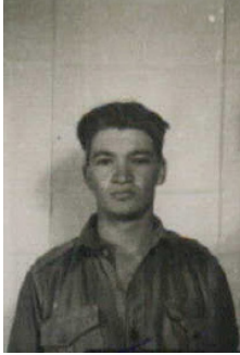
NAA: B883, QX50877