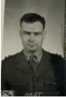
NAA 883, QX6344