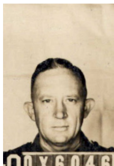
NAA B883, QX6046