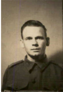
Image courtesy of the National Archives of Australia. NAA: B883, QX25418