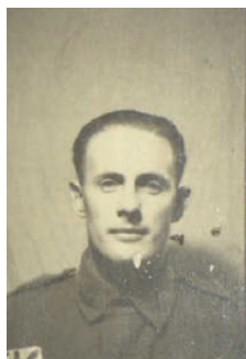
NAA: B883, QX27874