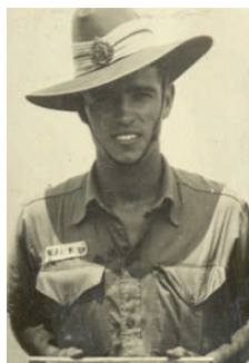
NAA A9300, KAUS W B