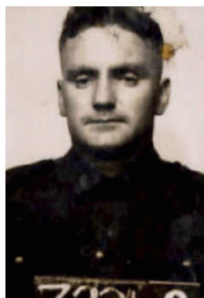
Image courtesy of the National Archives of Australia. NAA B883, QX10152