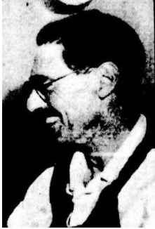
Sourced from the Courier Mail , 23 Jun 1950