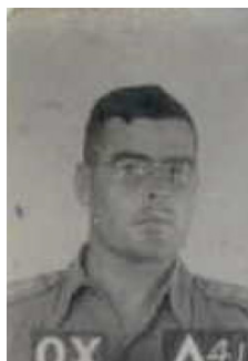
Image courtesy of the National Archives of Australia. NAA: B883, QX58749