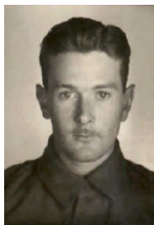
Image courtesy of the National Archives of Australia. NAA B883, NX20884