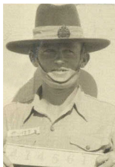
NAA A9300, HEWITT N T E