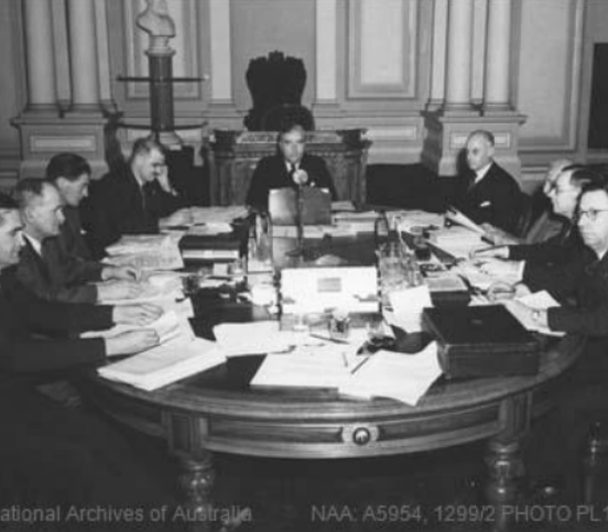
ational Archives of Australia NAA: A5954, 1299/2 PHOTO PL1