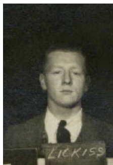
Image courtesy of the National Archives of Australia. NAA A12372, R/41118/H