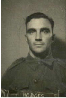
NAA B883, QX30519