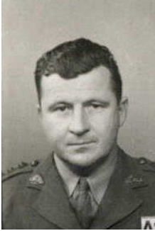
Image courtesy of the National Archives of Australia. NAA: B883, QX58749