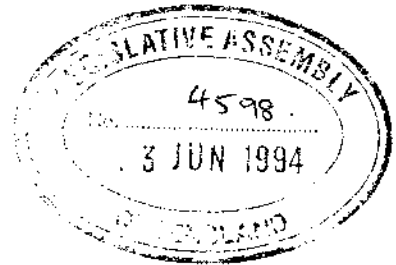
TABLE OF THE PARLIAMENT