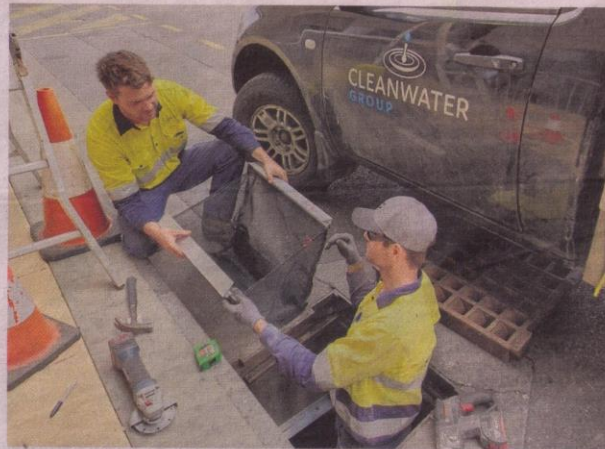
WAR ON WASTE: One of nine Drain Buddies is installed at Yeppoon.

The "local action" grants funded by the partnership between the Australian