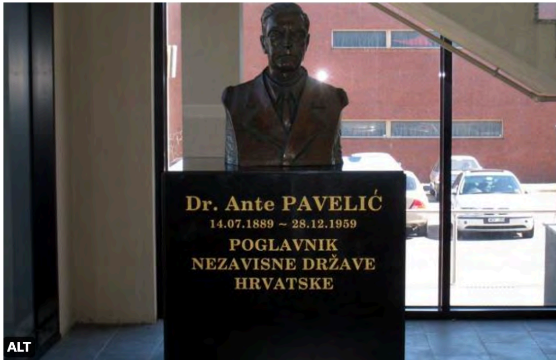
The caption states in Croatian: “Dr Ante Pavelic, Chief Leader of the Independent State of Croatia.”