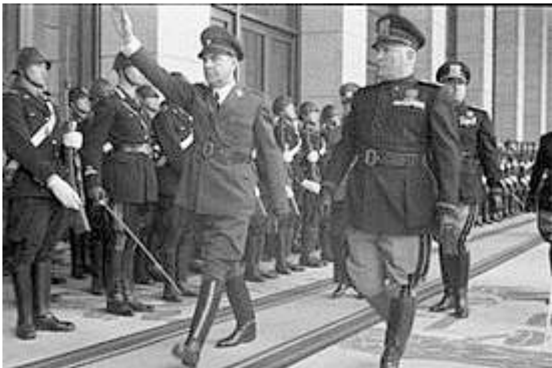
Croatian Fascist Ustasha “Chief Leader, Dr Ante Pavelic” with Italy’s Mussolini, giving the Ustasha fascist salute.