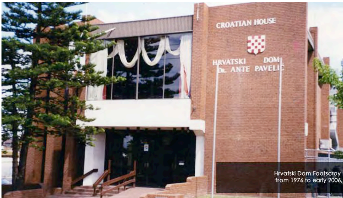
Croatian House in Footscray (Victoria) named after Croatian Fascist Ustasha “Chief Leader, Dr Ante Pavelic.”