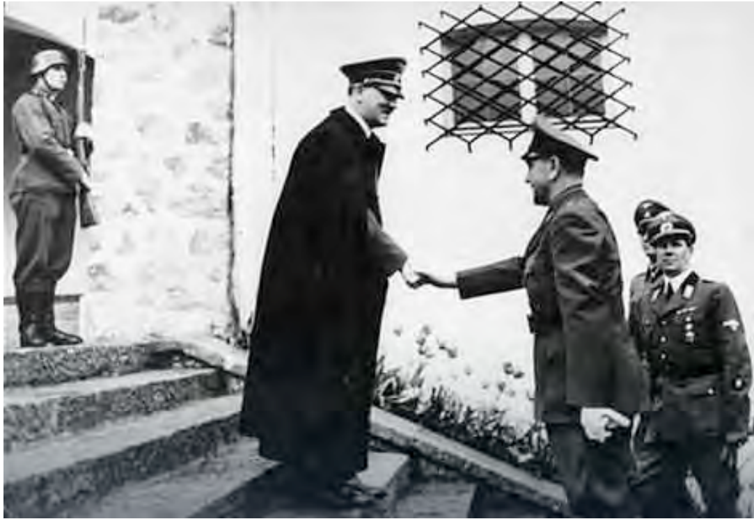
Croatian Fascist Ustasha “Chief Leader, Dr Ante Pavelic”, paying respects to Adolf Hitler.