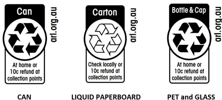
Figure 2: Combined ARL/CRS logo

Further cost reductions and efficiencies could be achieved by aligning CRS with GS1's National Product Catalogue, Australia's main barcode and product data repository. We also see potential in the newly launched FSANZ and GS1 Branded Food Database. If integrated into CRS, this database would provide manufacturers with one central platform to register their product and packaging information to meet both regulatory and voluntary requirements. Such a portal could reduce compliance costs.