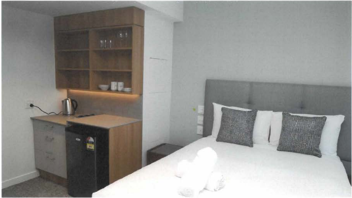
One of the bedrooms in the recently renovated parliamentary annexe building.

But every year, MPs must declare to the Tax Office any night they stay in the annexe that is not related to parliamentary business, and pay a sum, under fringe benefits tax rules.