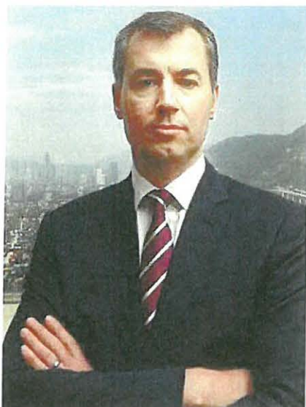
The Australian Justice Minister Michael Keenan