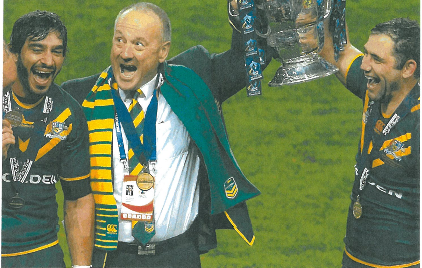
TROPHY WORTH GRABBING: Australia's World Cup heroes Johnathan Thurston and Cam Smith celebrate victory with coach Tim Sheens.