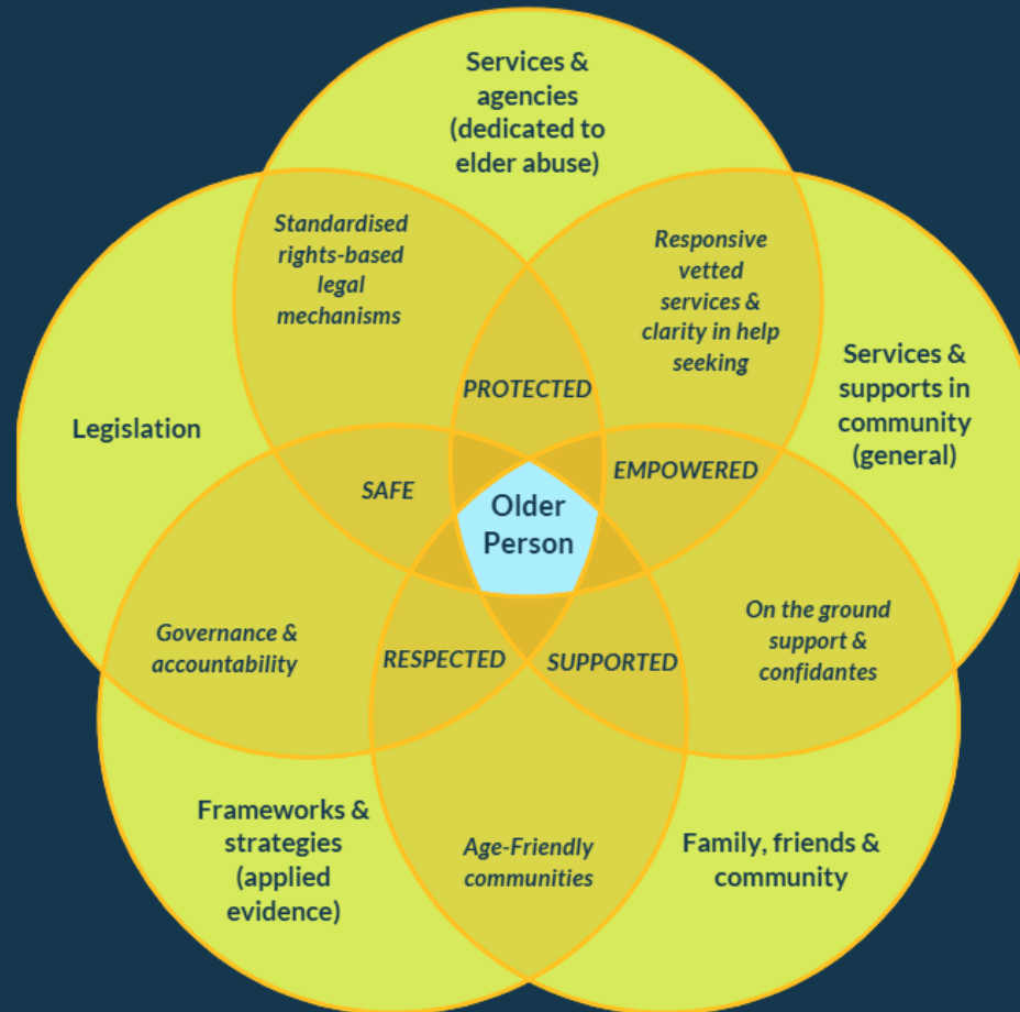
Figure 1. The big picture of Queensland legislation and supports and the positive impact to the older person

*Public Advocate (Qld), (2022). Adult Safeguarding in Queensland, Volume 2: Reform recommendations [November, 2022]. https://www.justice.qld.gov.au/_data/assets/pdf_file/0011/749027/adult-safeguarding-vol-2-final.pdf