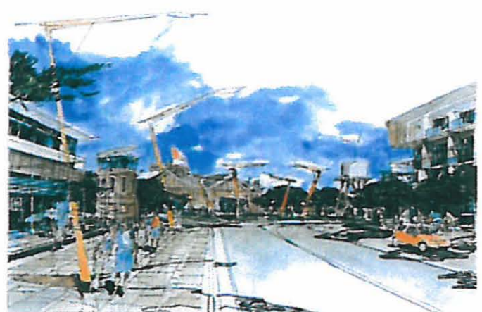
View from WM Hughes Street towards civic plaza