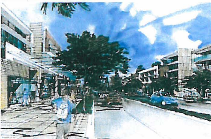
Looking south along Brisbane Street