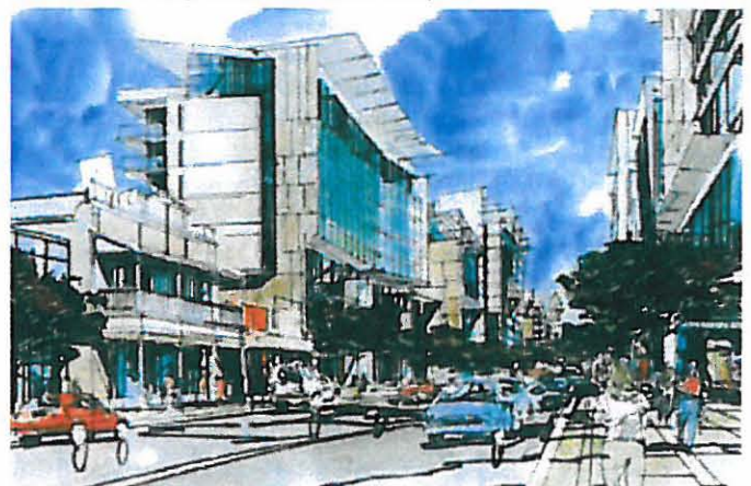
Brisbane Street looking westwards toward the post office tower