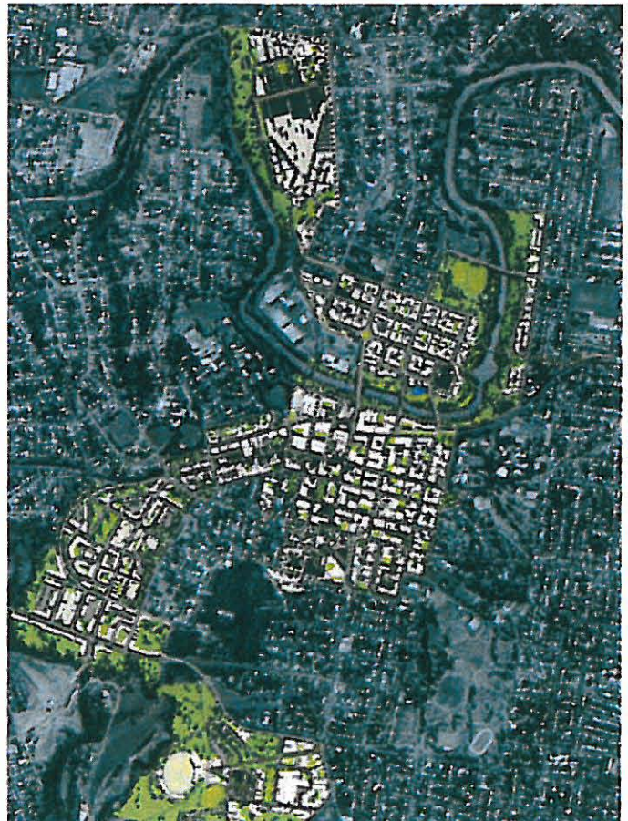
The Draft Master Plan - Key Revitalisation Areas