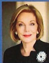
ITA BUTTROSE AC, OBE