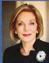
ITA BUTTROSE AC, OBE