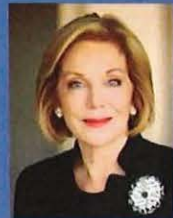
ITA BUTTROSE AC, OBE

Shelter Road COOMBABAH QLD 4216 PO Box 3253 HELENSVALE TOWN CENTRE QLD 4212 07 5509 9000 info@awqlqld.com.au ABN 75 521 498 584