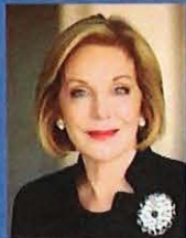
ITA BUTTROSE AC, OBE