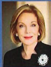
ITA BUTTROSE AC, OBE