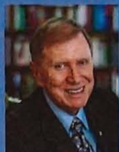
HON. MICHAEL KIRBY AC, CMG