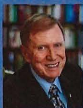
HON. MICHAEL KIRBY AC, CMG