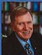
HON. MICHAEL KIRBY AC, CMG