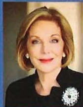
ITA BUTTROSE AC, OBE