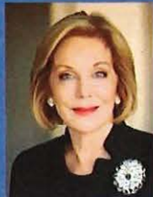
ITA BUTTROSE AC, OBE