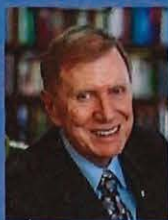
HON. MICHAEL KIRBY AC, CMG