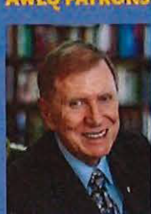
HON. MICHAEL KIRBY AC, CMG