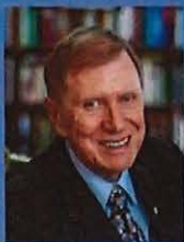
HON. MICHAEL KIRBY AC, CMG