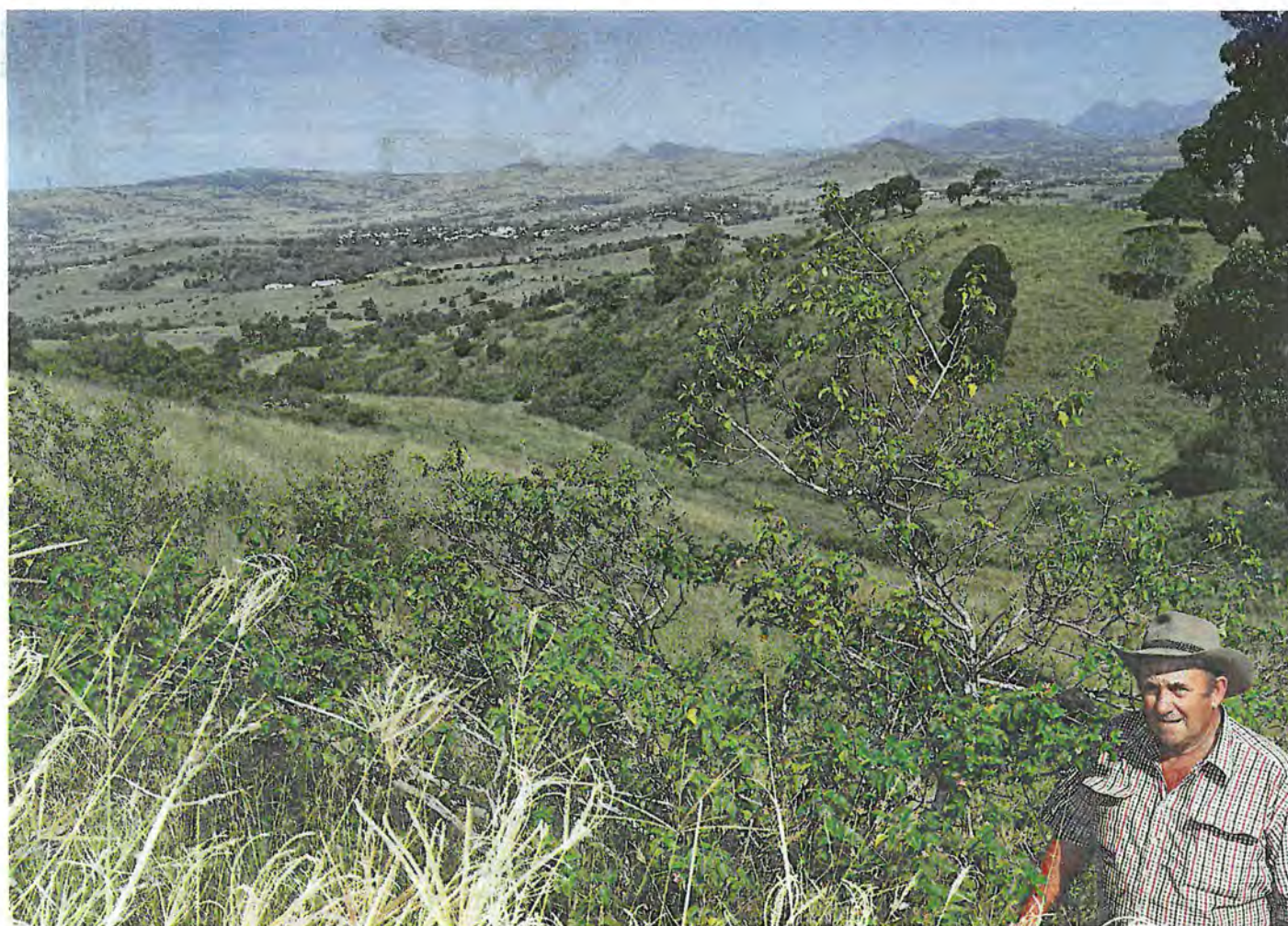
■ The lantana in the foreground and the grassland in the middle ground are shown on the vegetation mapping as an endangered Brigalow scrub ecosystem containing semi-evergreen vine thicket species which may include Casuarina cristata and Eucalyptus populnea - a listing that is clearly wrong says Mt French landholder, Bruce Wagner who took the Guardian to this property to indicate "just how wrong the maps are".