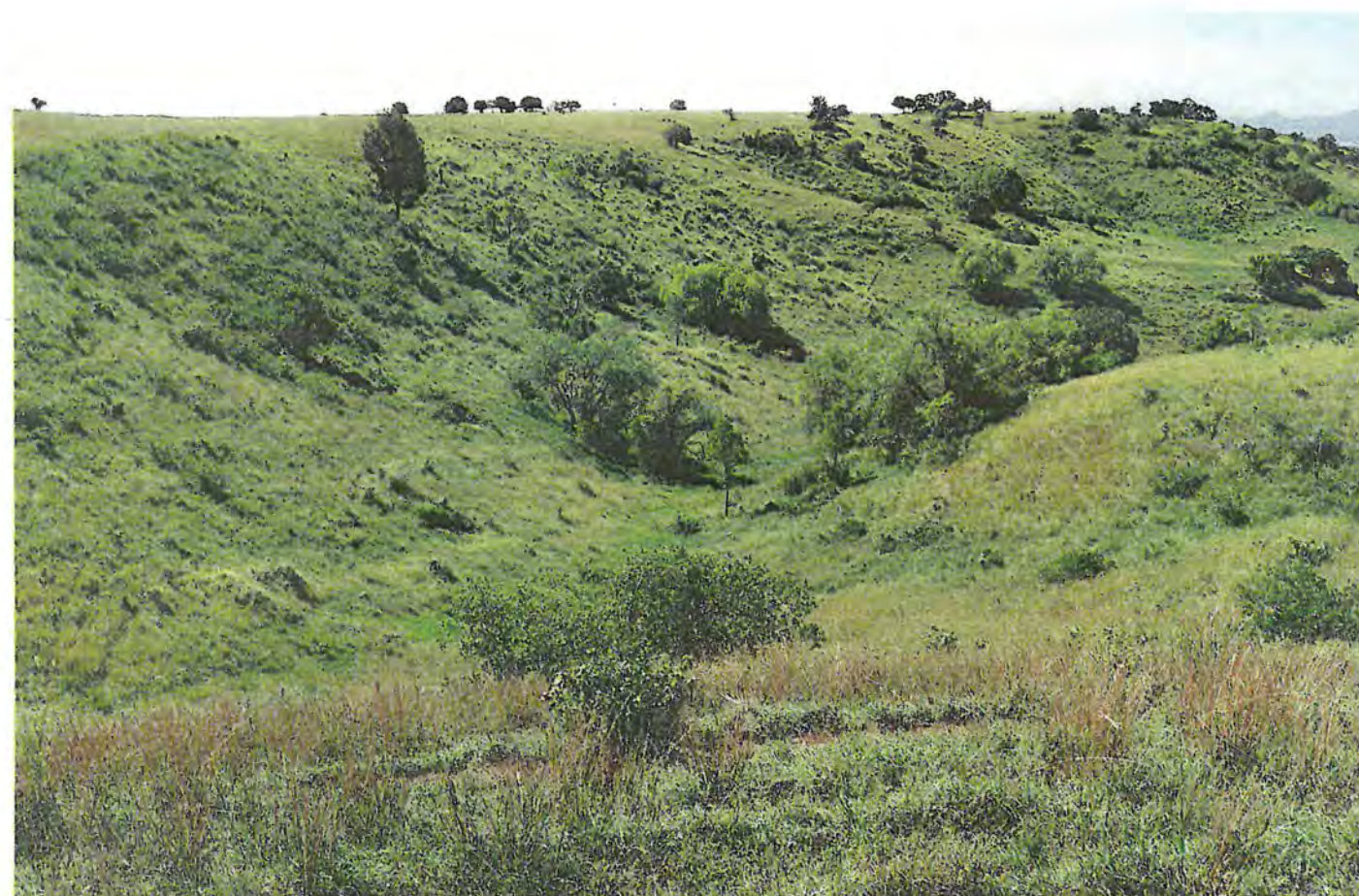
■ Much of the land depicted in this photograph is shown on the vegetation mapping as containing an endangered Brigalow scrub ecosystem containing semi-evergreen vine thicket species which may include Casuarina cristata and Eucalyptus populnea .

"If the government can't get the mapping right, then the legislation is nothing but a very sick joke."