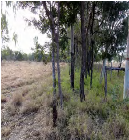
Grass green under savannah trees