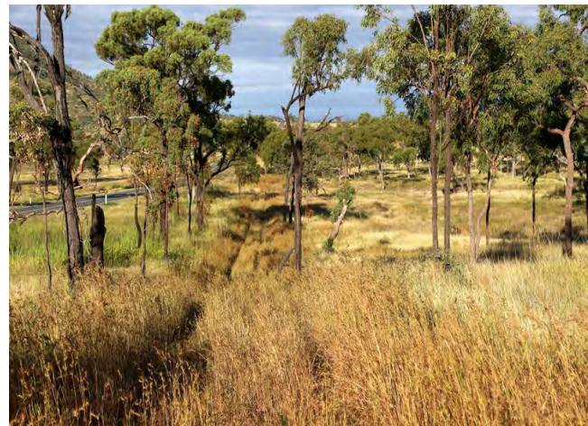
Fire break on grazed land – Grader grass infestation

http://www.daff.qld.gov.au/4790_7293.htm