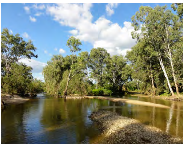
Pelican & Coral Creeks, Scottville via Collinsville