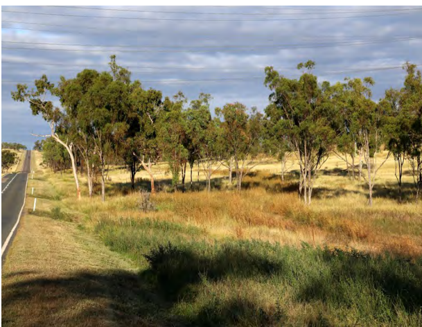
Peter Delamothe Road 5 km east of Collinsville

I have noticed that some landholders use heavy machinery to clear species like Lantana, Chinese Apple and Rubber Vine when a small amount of herbicide on the basal trunk or cut stump is all that is required. The downside of using dozers to clear weeds is obviously soil erosion but also from observation the weeds come back from seeds and roots and grow more vigorously because of the reduction of moderation from native vegetation. The weed problem is often exacerbated and many areas that have been cleared over the last 50 years are often now completely weed infested.