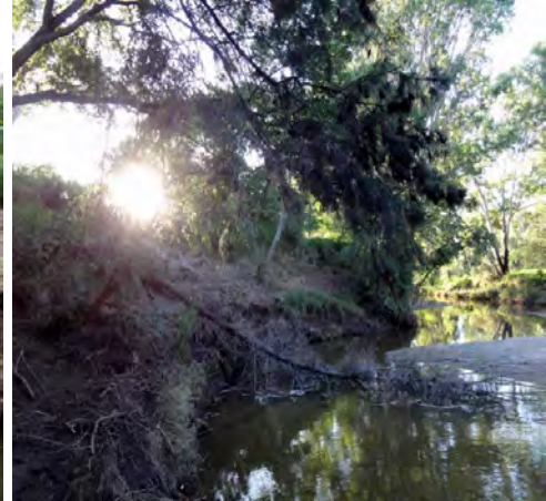
Coral Creek bank erosion rehabilitation