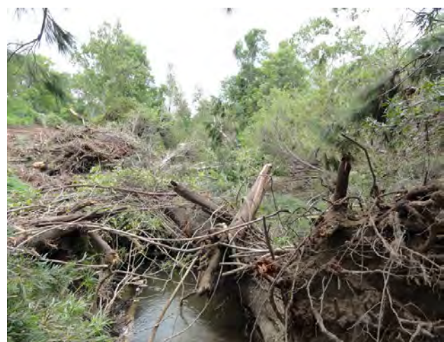
Pelican Creek 19.2.13 Governance Failure