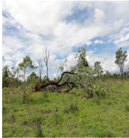
Leichardt Bean ( Cassia brewsteri ) dozed by a contractor on a neighbour's land