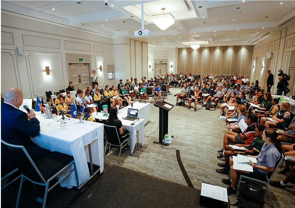
Junior Indigenous Youth Parliament, 2024.

Our Youth Parliament program gives your students the opportunity to experience some of the functions of Queensland Parliament first-hand .