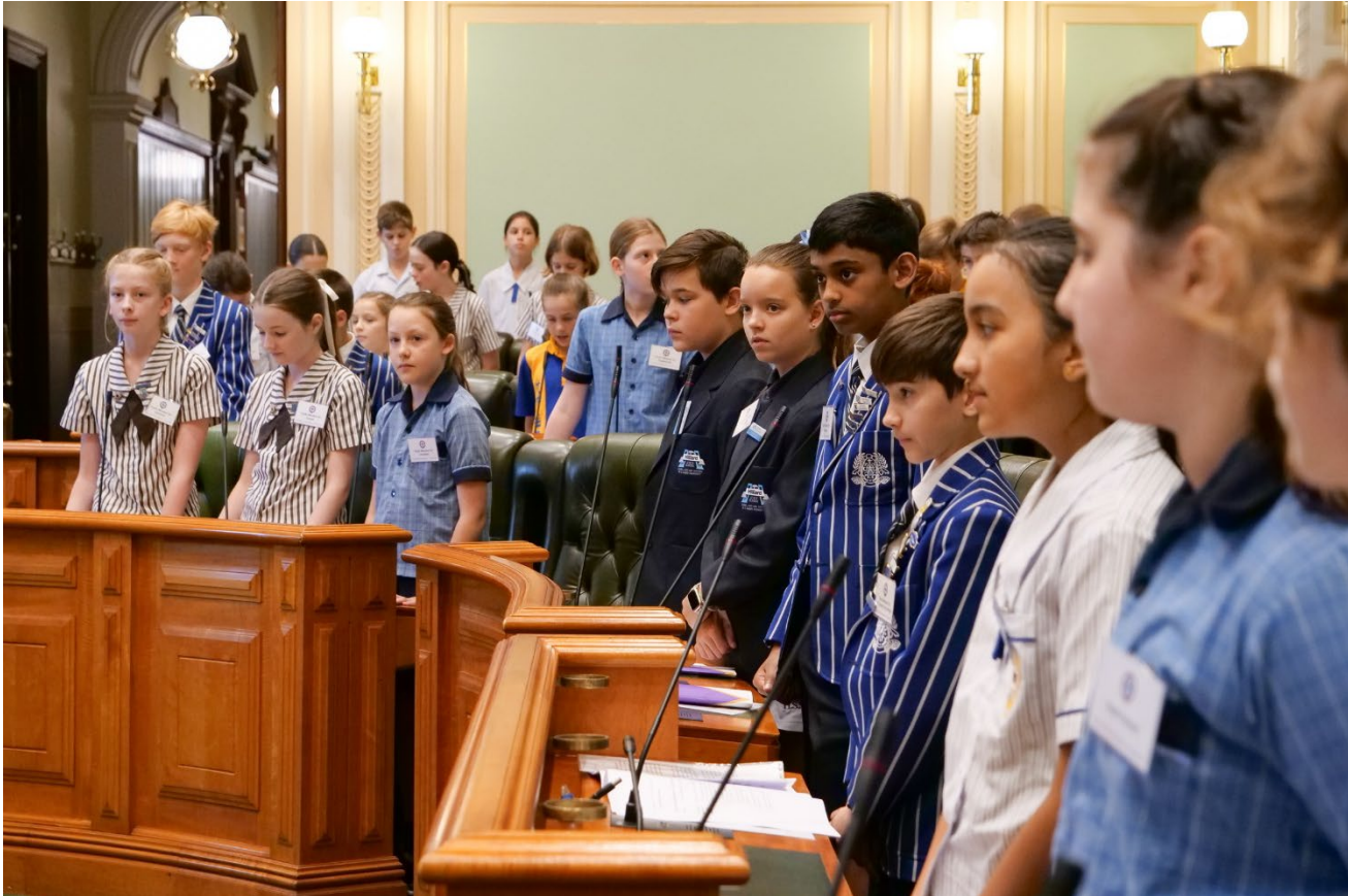
Brisbane East Youth Parliament, 2023.

Our Youth Parliament program gives your students the opportunity to experience some of the functions of Queensland Parliament first-hand .