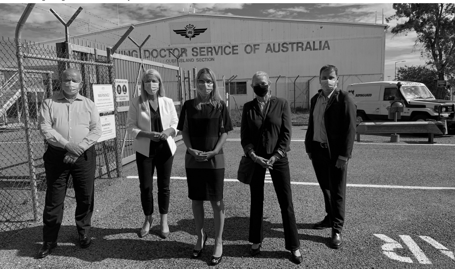
Image: Legal Affairs and Safety Committee – Mount Isa, 18 March 2021

2020, the Voluntary Assisted Dying Bill 2021 , the COVID-19 Emergency Response and Other Legislation Amendment Bill 2021 and the Criminal Code (Consent and Mistake of Fact) and Other Legislation Amendment Bill 2020 .