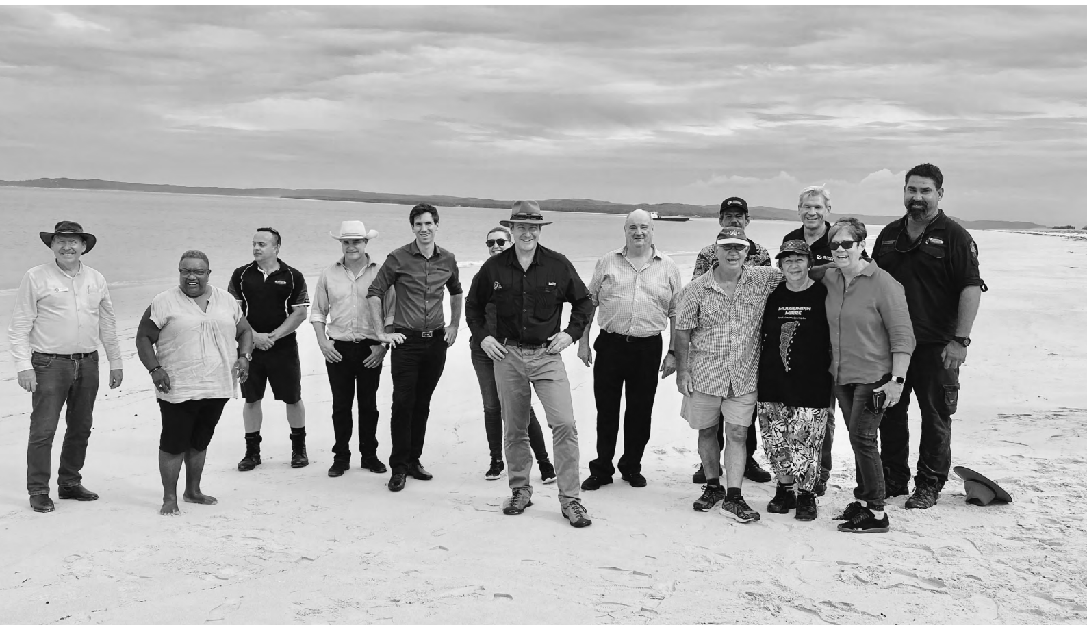
Image: State Development and Regional Industries Committee visit to Moreton Island, March 2021

Implementation of new videoconferencing capacity in February 2020 was timely. The COVID-19 pandemic has seen an increased use of video conferencing for committee proceedings. As detailed above, the new capacity has ensured committees can continue to meet, and to hear from people all around the state, the country, and internationally, fulfilling their functions while maintaining social distancing.