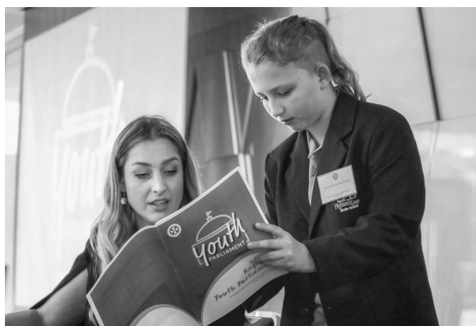
(Above) Youth Clerk of Parliament providing advice to the deputy Speaker at the Gold Coast Youth Parliament