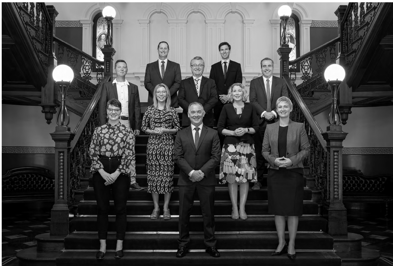
(Above) Official group photo of new Members of the 57th Parliament.