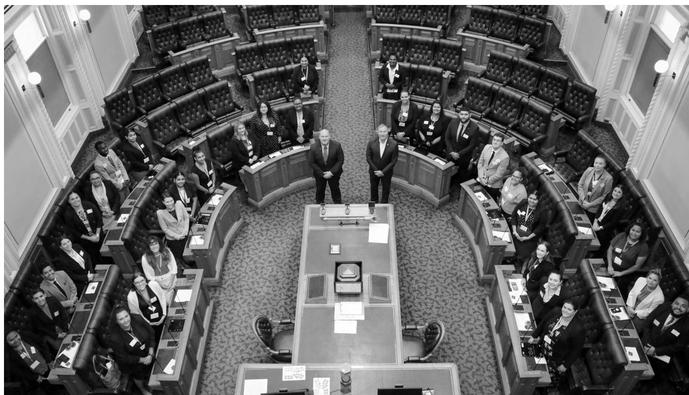
(Above) Official photo of the 2020 Eric Deeral Indigenous Youth Parliament