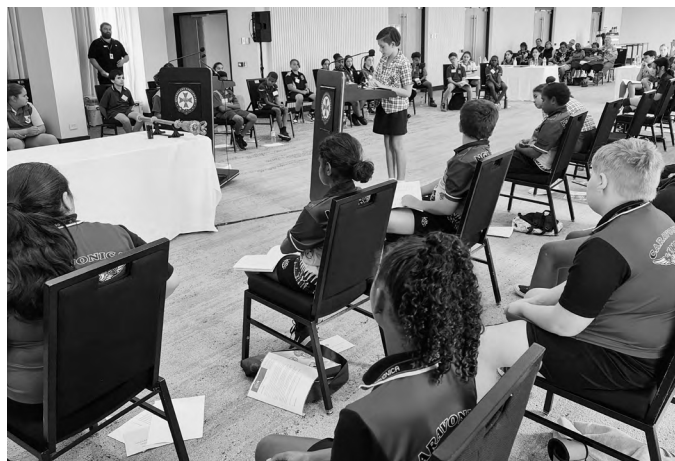
(Above) Youth Member giving speech at the Cairns Junior Indigenous Youth Parliament