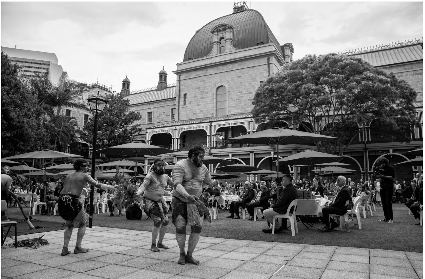
(Above) Tribal Experiences performing during the garden party.